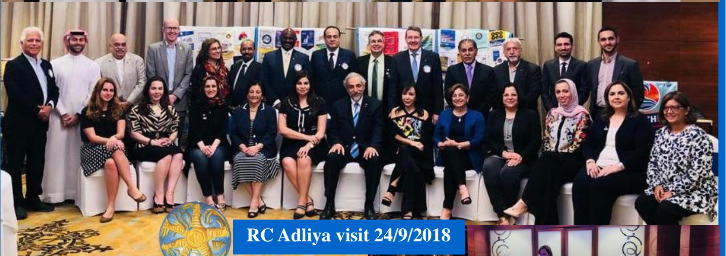
RC Adliya visit 24/9/2018