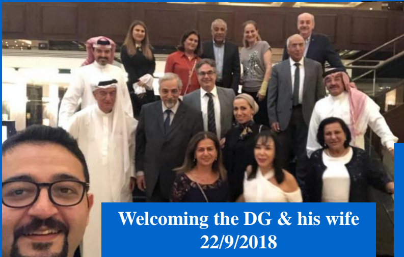
Welcoming the DG & his wife 22/9/2018