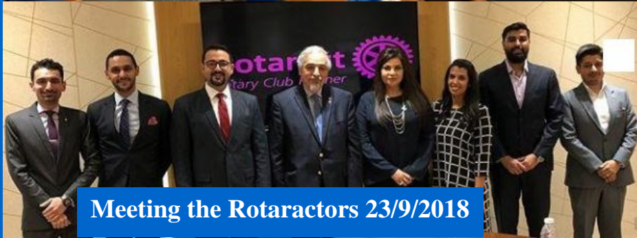
Meeting the Rotaractors 23/9/2018