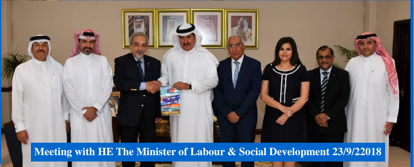
Meeting with HE The Minister of Labour & Social Development 23/9/2018