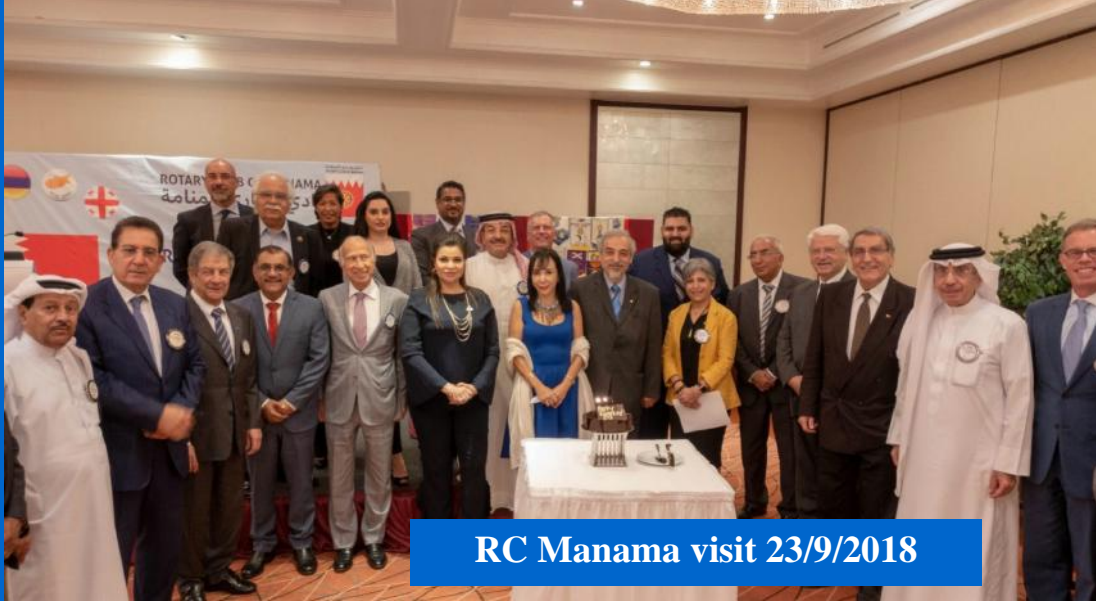
RC Manama visit 23/9/2018