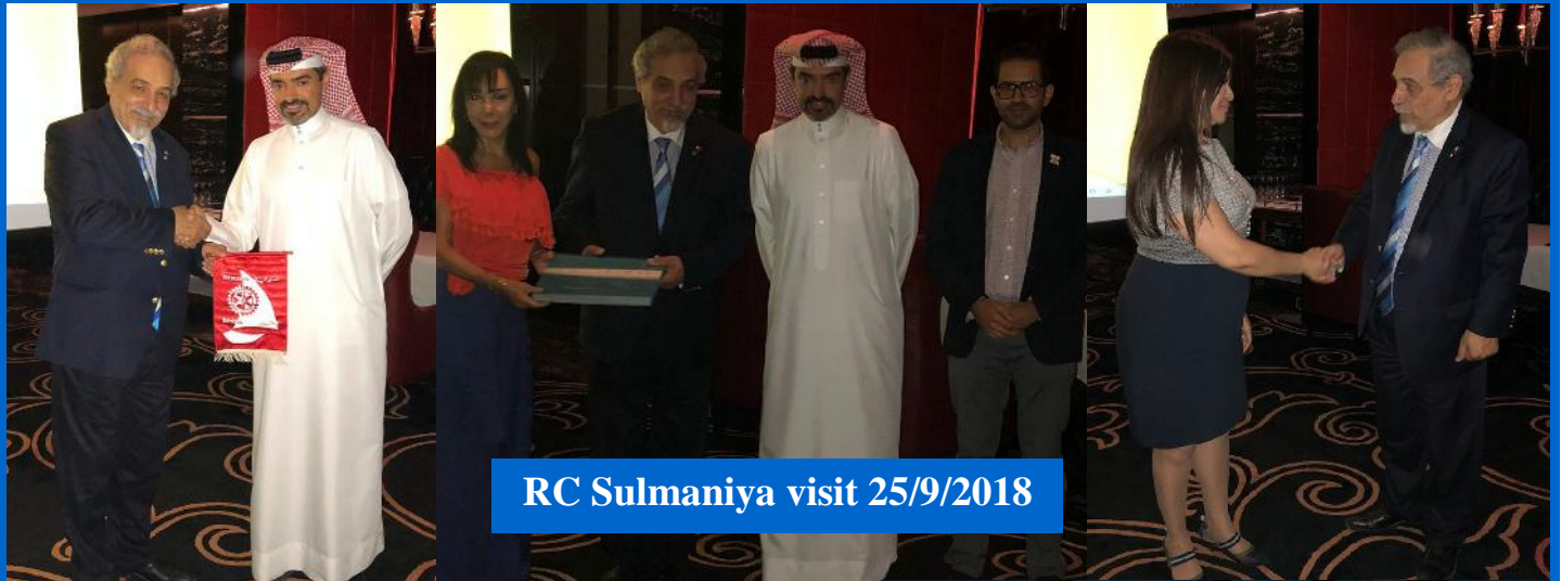
RC Sulmaniya visit 25/9/2018