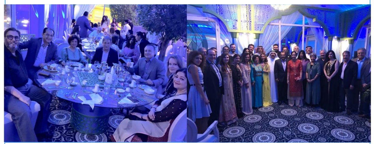
The 2nd Joint Ghabga was held on 3rd June 2018 at Bushido Hotel Manama. The joint event strengthen fellowship and cooperation among Rotarians who believe in the concept of ' Service Above Self' that all share and believe to serve the community.

The 3 Rotary Clubs (RC Manama, RC Sulmaniya & RC Adliya) and the Rotaract Club of Bahrain organized the 1st Joint Ghabga on 22nd May 2018 at the Gulf Hotel. The yearly event during the Holy Month of Ramadan is significant in terms of friendship, fellowship, trust and togetherness - the Rotary remanence that encourage all Rotarains to work unitedly for the betterment of the clubs and communities.